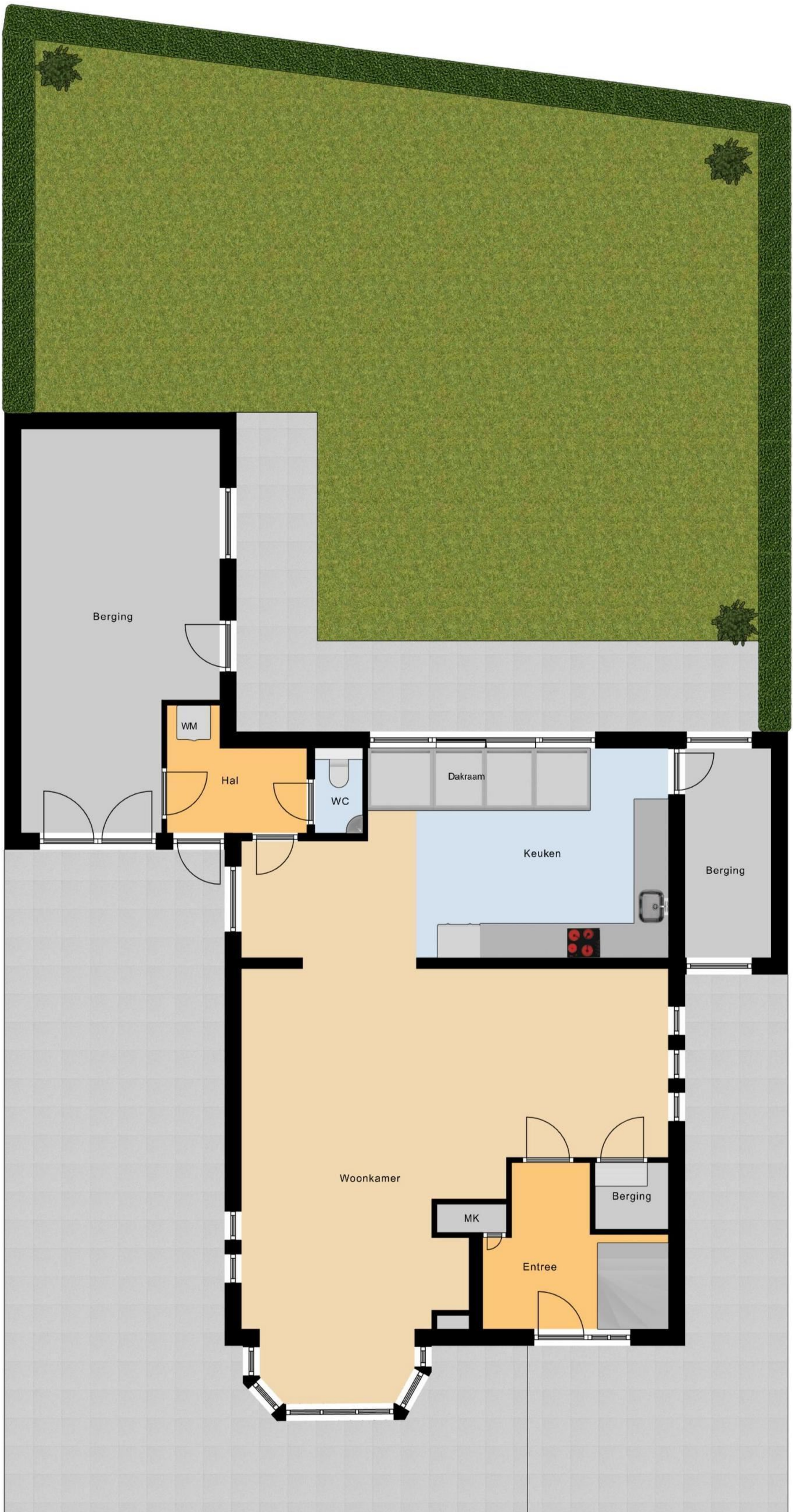
Begane Grond Tuin