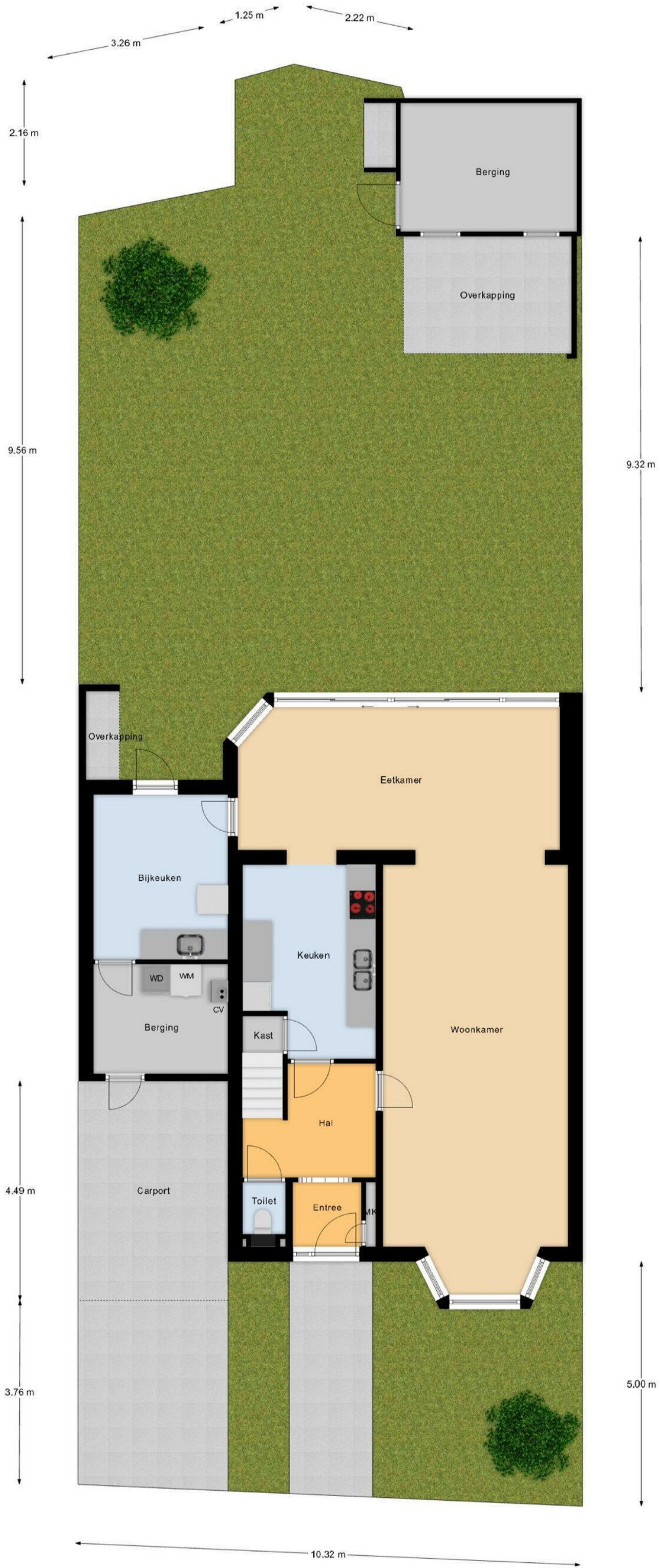
Begane Grond Tuin