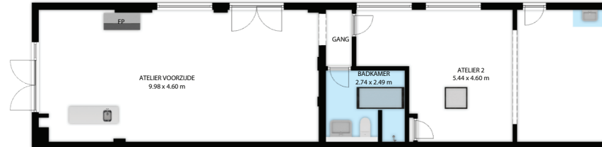
(NIET IN POSITIE)