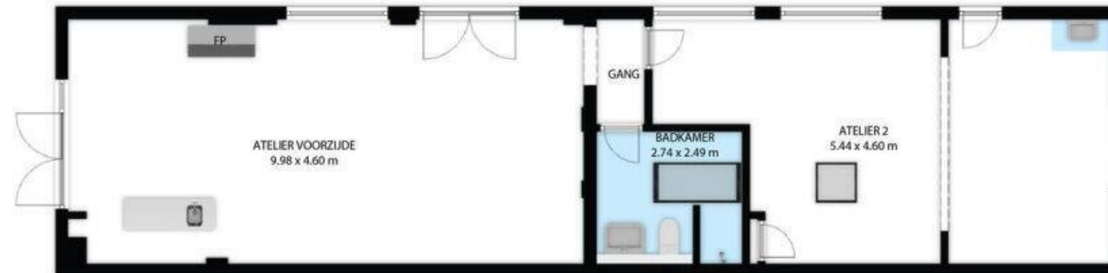
(NIET IN POSITIE)